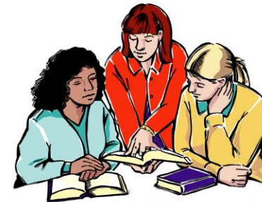
Women's Bible Study

The Agenda for the January 30 th congregational meeting and the Annual Reports are ready for pick up today. For those staying for the luncheon, you can pick up a copy of the Agenda and Annual Reports on your way out of Woolverton Hall after the luncheon and for those not staying there are copies on the Welcome Desk or at the back door of the church as well.